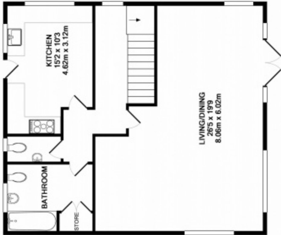
GROUND FLOOR APPROX. FLOOR AREA 793 SQ.FT. (73.7 SQ.M.)